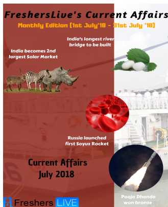
July 2018 Current Affairs