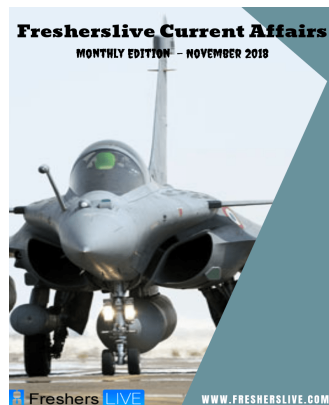
November 2018 Current Affairs