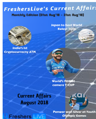
August 2018 Current Affairs