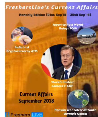
September 2018 Current Affairs