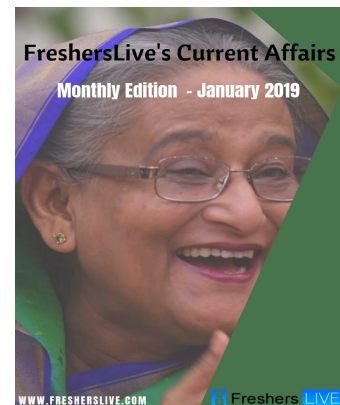
January 2019 Current Affairs