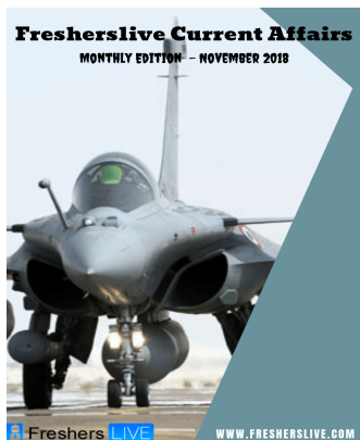
November 2018 Current Affairs