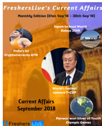
September 2018 Current Affairs