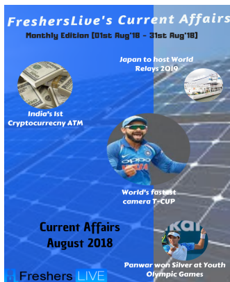
August 2018 Current Affairs